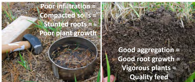
Figure 1 and 2 (Above). Pictures of the infiltration test (above left) and an soil sample with good aggregation (above right).