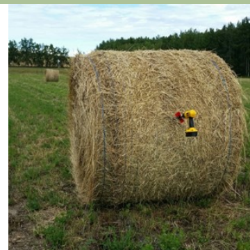
Each sample is a composite of 10 to 12 cores with feed probe.

There were several certified seed growers in the Peace who grew birdsfoot trefoil. Paul Wuthrich grew birdsfoot trefoil for seed about 25 years ago. In those days, it was difficult to harvest, hard to clean and even more challenging to sell. Most of the seed was sold to BC Ministry of Highways for road repairs.