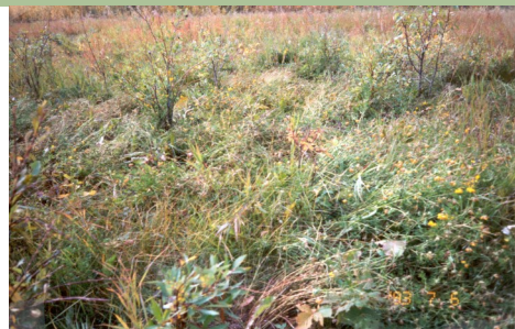
Birdsfoot trefoil seeded in 1982 & thriving 18 years later at Farrell Creek.