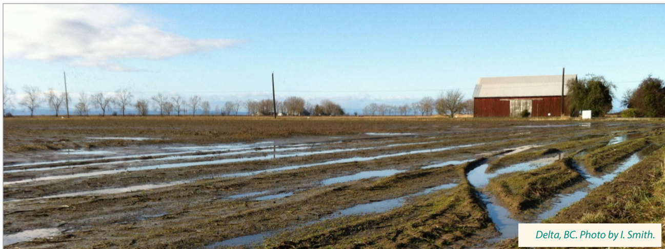
Delta, BC.

To minimize the potential for contamination during a flood, ensure that hazardous materials are stored, maintained and managed in accordance with BC's Hazardous Waste Regulation and the Code of Practice for Agricultural Environmental Management .