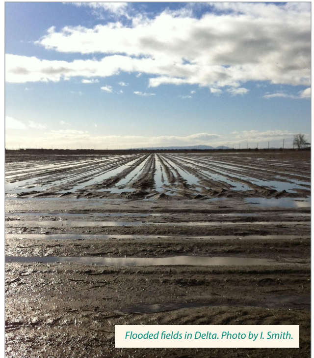
Flooded fields in Delta.

Key location information about your operation must be summarized so that it can be shared quickly with others (e.g., employees, emergency responders) for planning or during an emergency. An agriculture operation map will help capture and communicate important aspects of your operation, including location of buildings, hazardous materials, equipment and livestock.