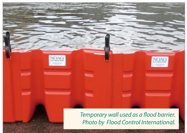
Temporary wall used as a flood barrier.

Water-inflated tubing can be used as a temporary flood barrier around buildings, or between buildings and rising water levels. Water-inflatable barriers are easier to erect than sandbag levees or walls, take much less time to set up, and require minimal storage space when deflated. The barriers are available in varying sizes and shapes.