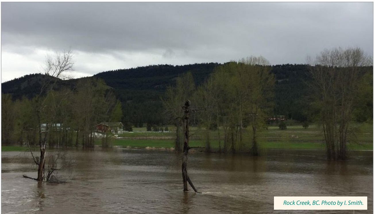
Rock Creek, BC.