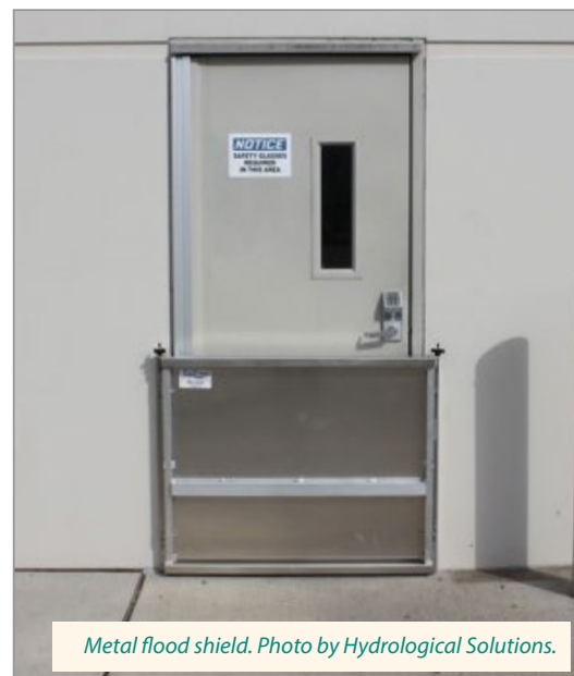
Metal flood shield.

If flooding is expected imminently and equipment cannot be moved to high ground, consider placing smaller equipment into flood bags . These are large impermeable bags that can be sealed and are designed to limit damage to equipment and small and medium vehicles.