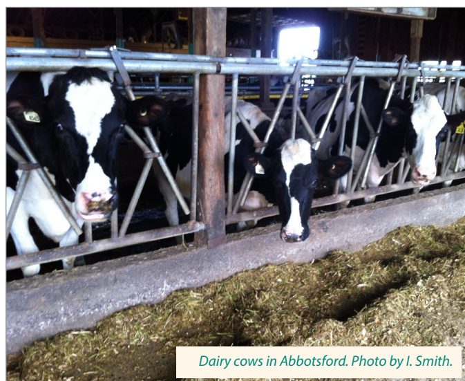
Dairy cows in Abbotsford.

The local government will issue an evacuation rescind statement when it is safe for residents to return home. Livestock should be returned as soon as it is safe to do so. It is important to be aware that in some situations, the flood risk may reoccur and the potential for the reinstatement of the evacuation order remains.